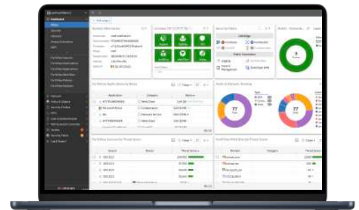
Comprehensive view of network performance, security, and system status